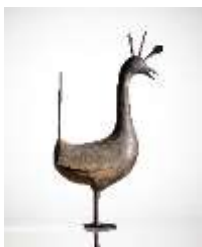
Peacock, steel with in gold and silver decoration, Iran, Isfahan, 19th century; Embroidered shawl (detail), wool and silk, Iran, 19th century.

http://www.holburne.org/events/bath-to-baghdad/?instance_id=12042