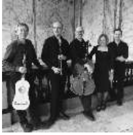
Baroque and Beyond