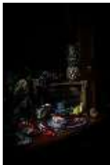
Image caption: for Made For the Table images, they just must be credited with: The Silverware Still Lives , 2017 - Photo: Rosalind Atkinson | Art Direction: Tasha Marks.

http://www.holburne.org/events/art-dine-made-for-the-table/?instance_id=11974