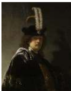
Self-Portrait Wearing a White Feathered Bonnet, Rembrandt van Rijn, 1635