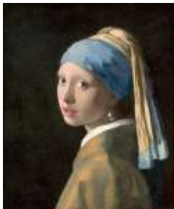
Johannes Vermeer (1632–75), Girl with a Pearl Earring, c.1665 ; Cornelis de Heem (1631–95)