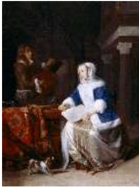
The Duet , Gabriel Metsu, 1660-7