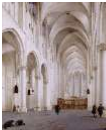
St Catherine's Church Utrecht, Pieter Jansz Saenredam, 1636

http://www.holburne.org/events/prized-possessions-dutch-masterpieces-from-national-trust-houses/?instance_id=12039