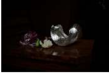
The Silverware Still Lives (detail), 2017. Art Direction: Tasha Marks